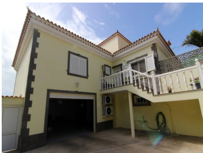
Outside view of the villa

All information is correct to the best of our knowledge. Errors and prior sale excepted. This prospectus is purely for information purposes. Only the notarized deed of sale is legally binding.