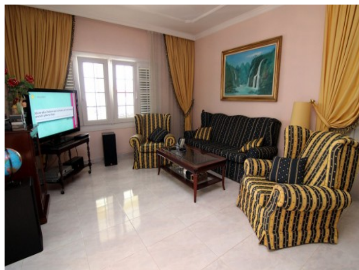
Lightflooded living area