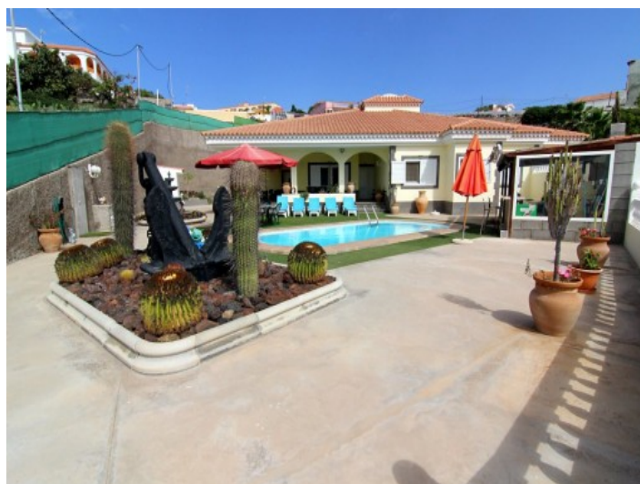
Outside area with pool bar