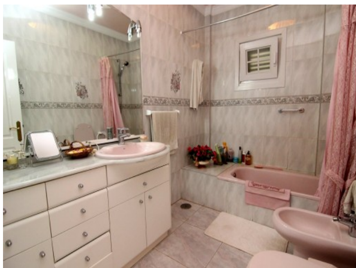
One out of 5 bathrooms