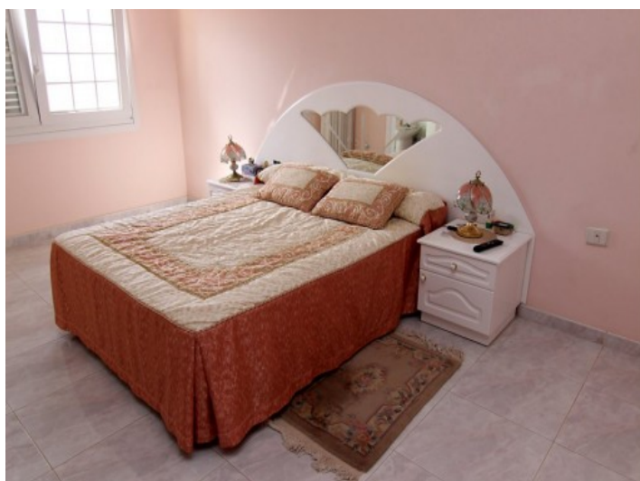
One out of 4 bedrooms