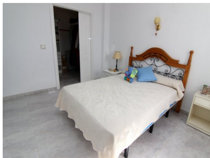
One out of 4 bedrooms with dressing room

All information is correct to the best of our knowledge. Errors and prior sale excepted. This prospectus is purely for information purposes. Only the notarized deed of sale is legally binding.