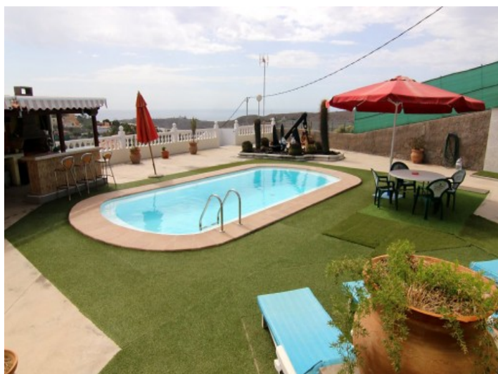
Sea view from the pool area