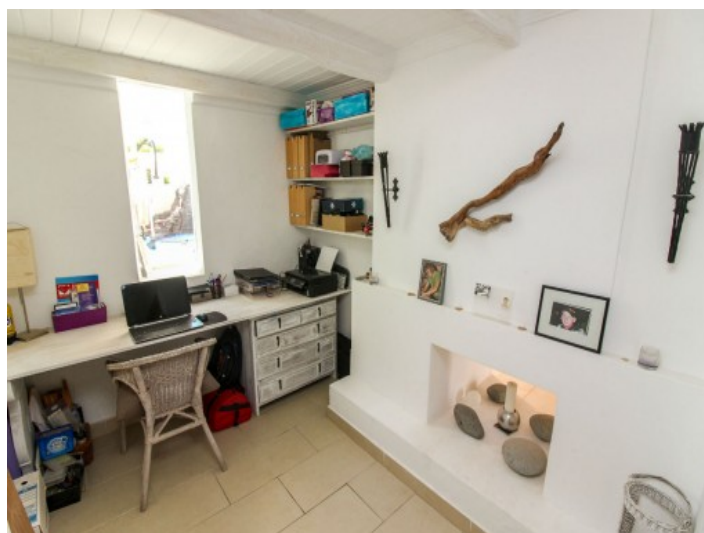
Bright study room

All information is correct to the best of our knowledge. Errors and prior sale excepted. This prospectus is purely for information purposes. Only the notarized deed of sale is legally binding.