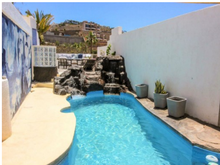
Private pool with small waterfall