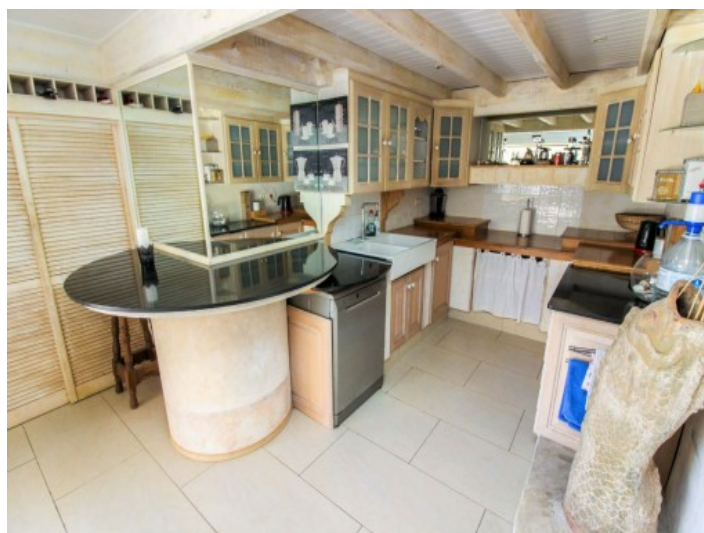
Kitchen with wooden fronts