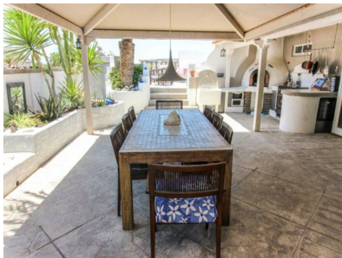
Covered terrace with barbecue area