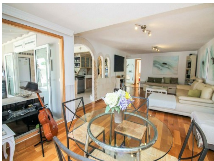
Cozy living and dining area