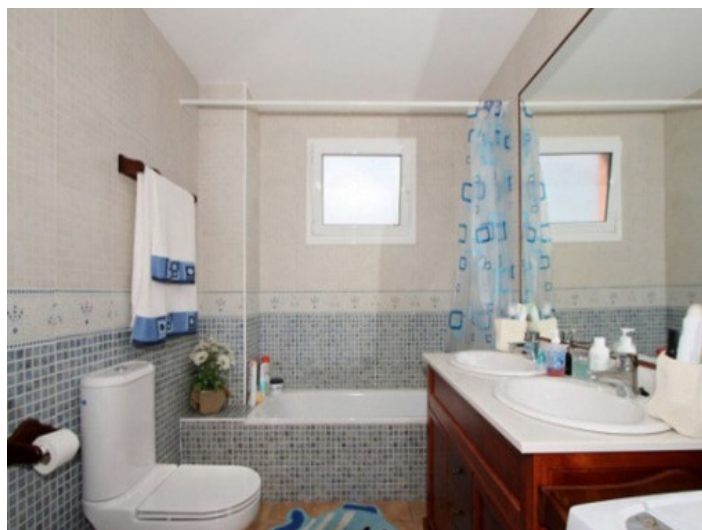
One out of 2 bathrooms

All information is correct to the best of our knowledge. Errors and prior sale excepted. This prospectus is purely for information purposes. Only the notarized deed of sale is legally binding.