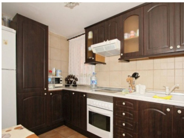
Modern fully equipped kitchen