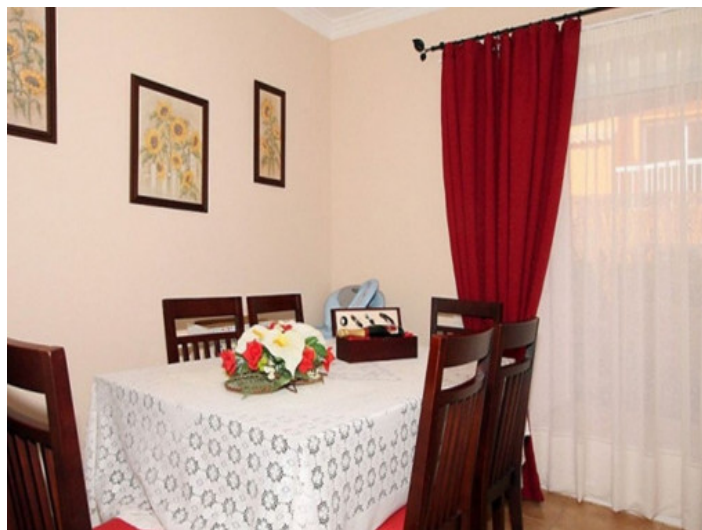
Friendly dining area