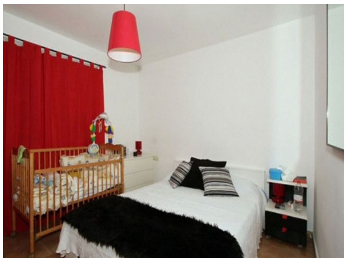
One out of 3 bedrooms