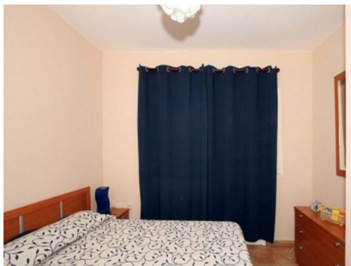
One out of 3 bedrooms