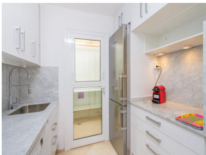
Kitchen with utility room