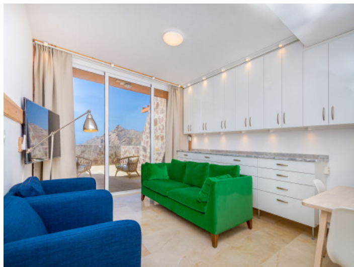
Living area with access to the terrace