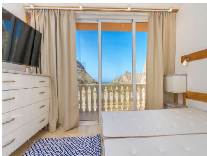
Bedroom with sea views

All information is correct to the best of our knowledge. Errors and prior sale excepted. This prospectus is purely for information purposes. Only the notarized deed of sale is legally binding.