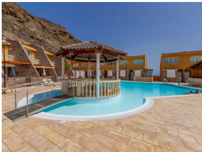
Large community pool area