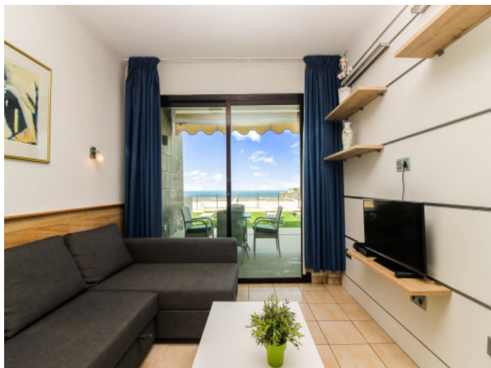
Living area with sea views