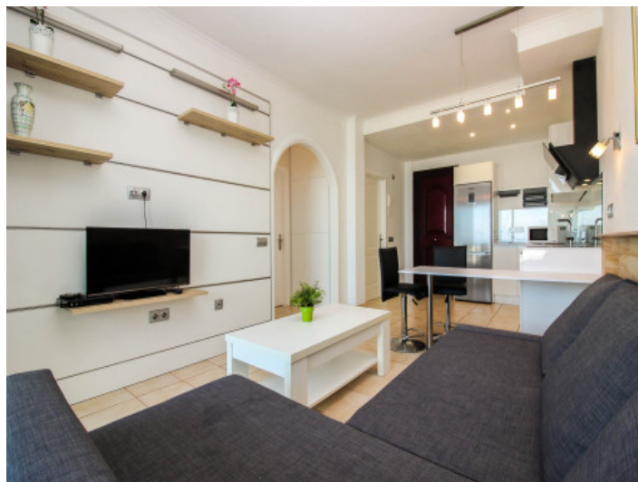
Living area with open kitchen