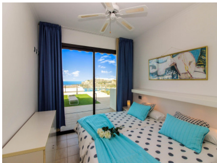
Bedroom with sea views

All information is correct to the best of our knowledge. Errors and prior sale excepted. This prospectus is purely for information purposes. Only the notarized deed of sale is legally binding.