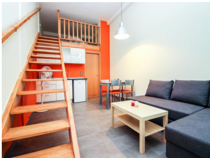
Further living area