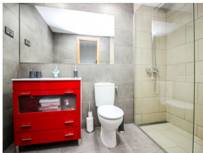
Modern bathroom with shower

All information is correct to the best of our knowledge. Errors and prior sale excepted. This prospectus is purely for information purposes. Only the notarized deed of sale is legally binding.