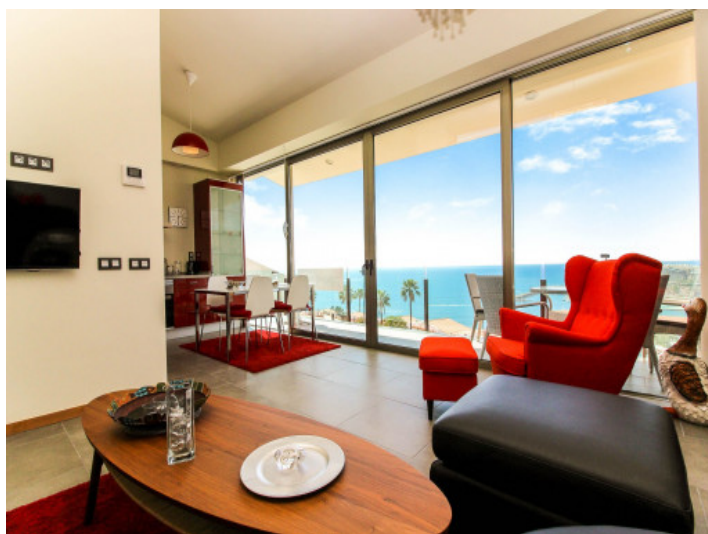
Amazing sea views from the living area