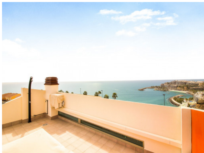
Roof terrace with sea views