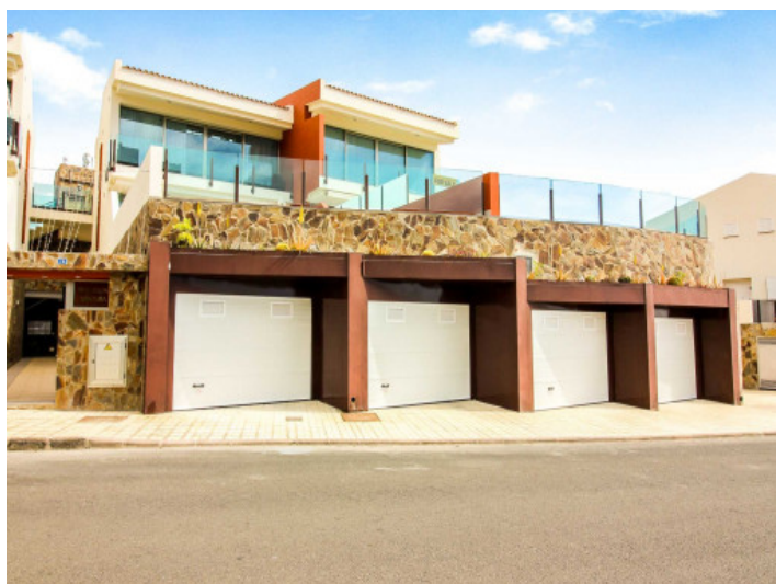
Exterior view with garage

All information is correct to the best of our knowledge. Errors and prior sale excepted. This prospectus is purely for information purposes. Only the notarized deed of sale is legally binding.